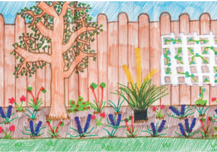
This delightful drawing by nine-year-old Lachie Chaytor was one of the winners of our 10 Hortex garden packs.

We also featured a children's garden drawing competition with the prizes of 10 Hortex garden packs, supported by Padstow Grange Distributors of Belmont.